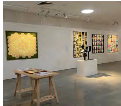
Reconfigured Install images, 2025