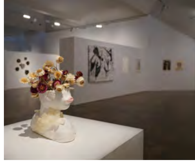
SHOWCASE Install image, 2025