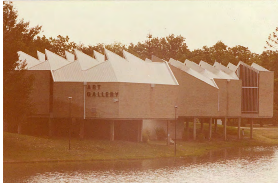
Benalla Art Gallery, c. 1980s