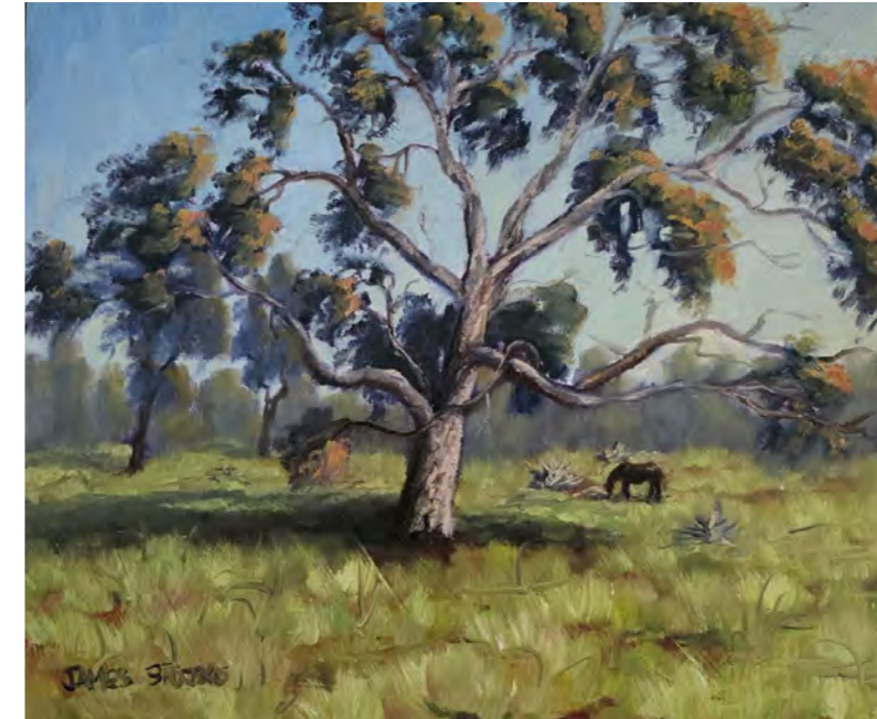
Top Left: James Stojko Eucalyptus Swanpool 2021, oil on board, 41.5 × 50.5 cm