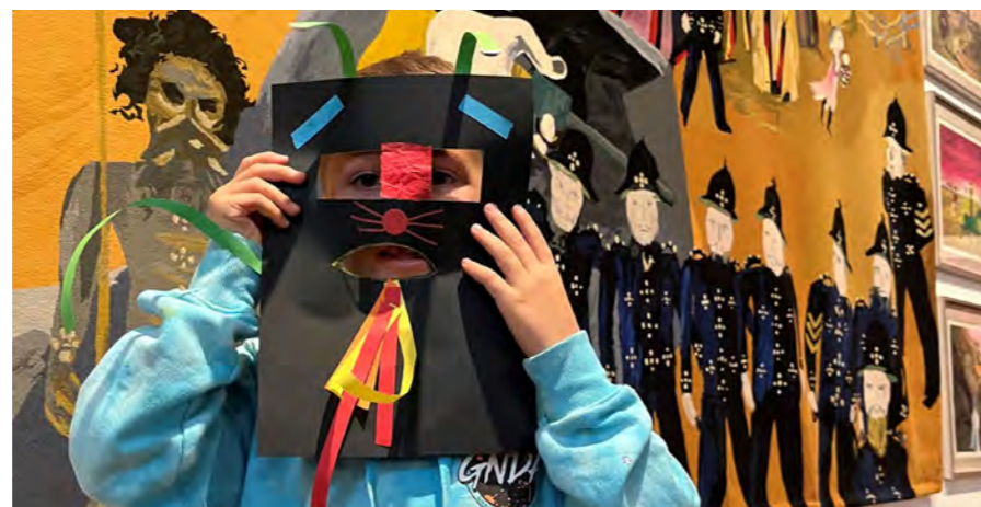
PEEP participant showing their Ned Kelly mask artwork, coinciding with the showing of the Sidney Nolan and Portalegre Glenrowan tapestry within the exhibition Nocturne , during the July PEEP sessions at Benalla Art Gallery

Tomorrow Today is a local Foundation working to enable the people of Benalla to create a stronger, more resilient and prosperous rural community. The Foundation's major project is the Education Benalla Program.