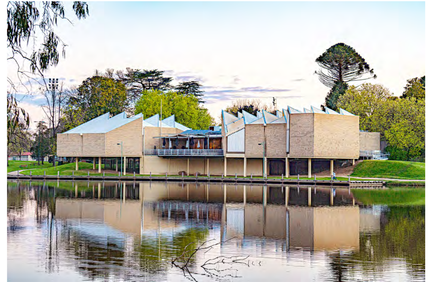
Benalla Art Gallery, 2021