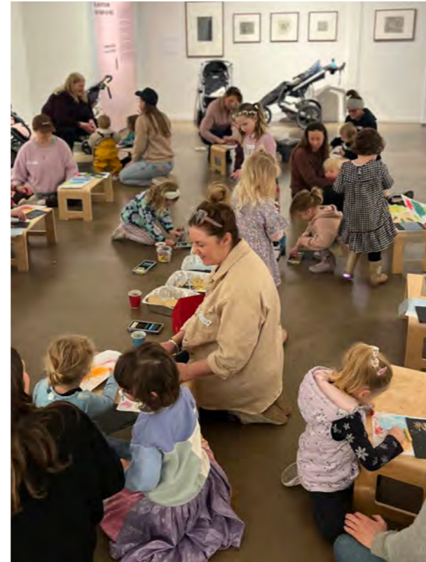
Little Artists programs throughout 2025