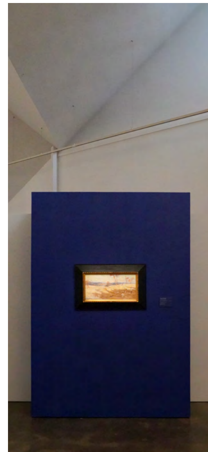
Some of our favourites: Benalla Art Gallery Collection Install image, 2025

The exhibition reaffirmed the importance of the Collection not only as a record of artistic achievement, but as a shared and cherished resource held in trust for the community.