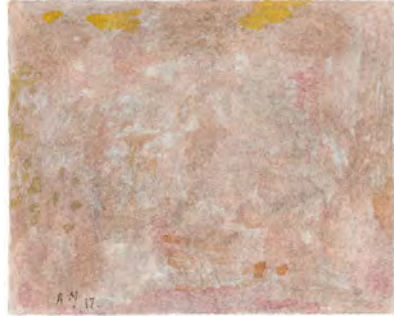
Allan MITELMAN Untitled [Reference # 25] 2017 watercolour on paper 15.25 x 18.5 cm 2023.080 Donated through the Australian Government's Cultural Gifts Program by Celeste Douglas, 2023 Benalla Art Gallery Collection © Courtesy of the artist