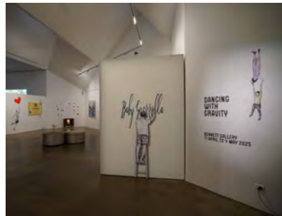
Baby Guerrilla: Dancing with Gravity Install image, 2025

The exhibition provided 2024 students from across the region the opportunity for artistic recognition in a public art space. Representative of a range of media and topics, this exhibition highlights the creativity and diverse talents of young and emerging artists within our community.