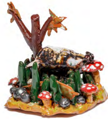
Miles Howard-Wilks Magpie and Toadstools and a Lady Bug 2020 glaze, terracotta, 10.5 × 10 × 14 cm MHC20-0008 © Copyright the artist Represented by Arts Project Australia, Melbourne