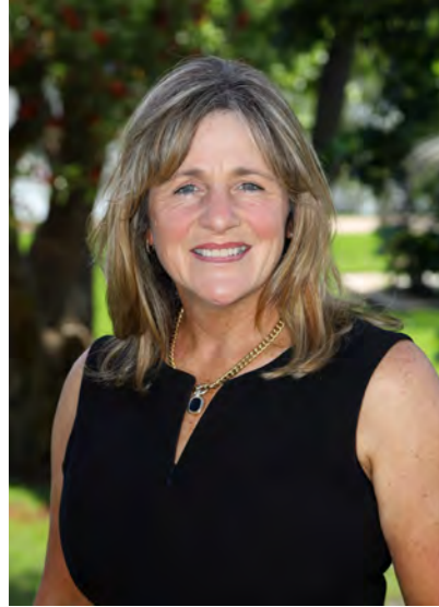
Cr Bernie Hearn Mayor of Benalla Rural City