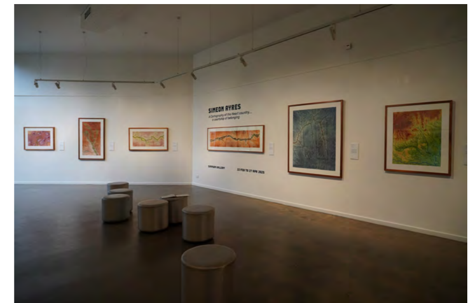
Simeon Ayres: A Cartography of the Heart country... a courtship of belonging Install image, 2025

Created without drones or satellite imagery, the works stripped away human interventions to speculate on pre-settlement landscapes and deep time. Themes of relationality, regeneration and change were central, tracing rivers, fire cycles and unseen systems beneath the ground. Living in the Strathbogie Ranges, the self-taught artist brought a deeply personal and intuitive approach to representing place.