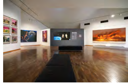
Nocturne: Benalla Art Gallery Collection Install image, 2024